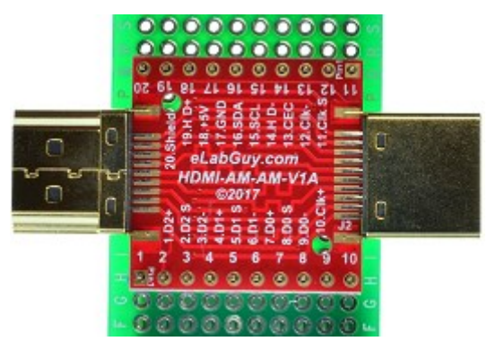
Figure 2: Example of connecting the HDMI-AM-AM-V1A on a proto PCB (Note: This picture only shows the pins spacing, actual use may not be used on a breadboard)